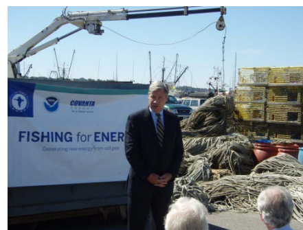
Senator Sheldon Whitehouse speaks at a Fishing for Energy event in Newport, RI

Line - nylon, polypropylene - as tightly coiled as possible